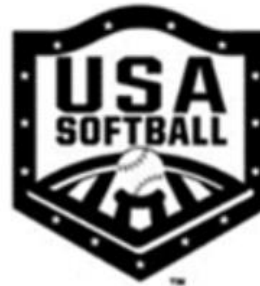
USA Softball New

Certified for use in Adult Men's (U23 and Above Fast Pitch competition ONLY and all Slow Pitch.